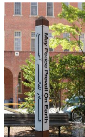
Peace pole in meditation garden